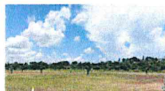
Inter-Year Cricket Tournament