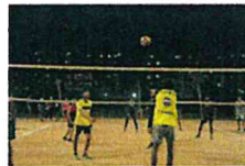
Inter-Year Volleyball Tournament

inter-institute match with Mother's Public School